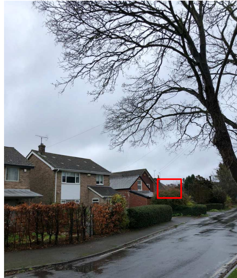
STREET SCENE FACING EAST