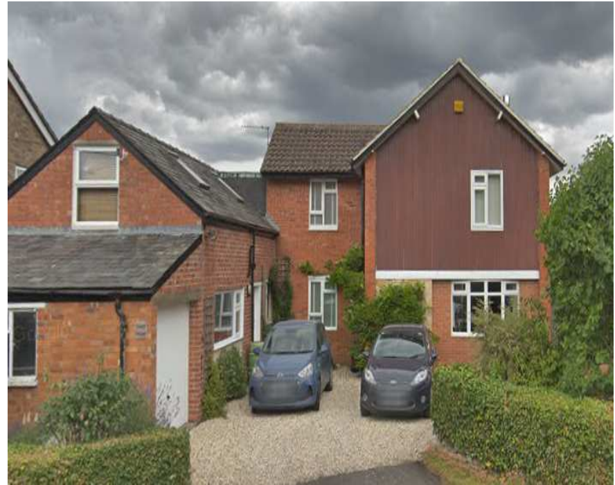
ADJACENT PROPERTY TO THE WEST