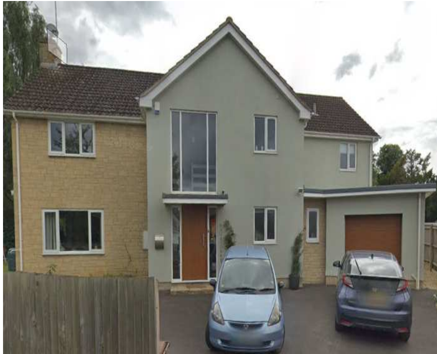
PROPERTY OPPOSITE THE APPLICATION SITE