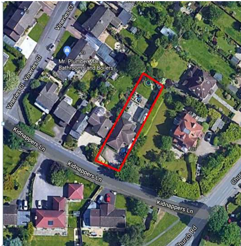
AERIAL IMAGE OF APPLICATION SITE