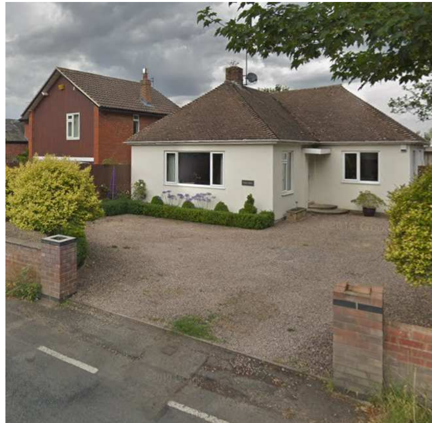
FRONT (PRINCIPAL) ELEVATION