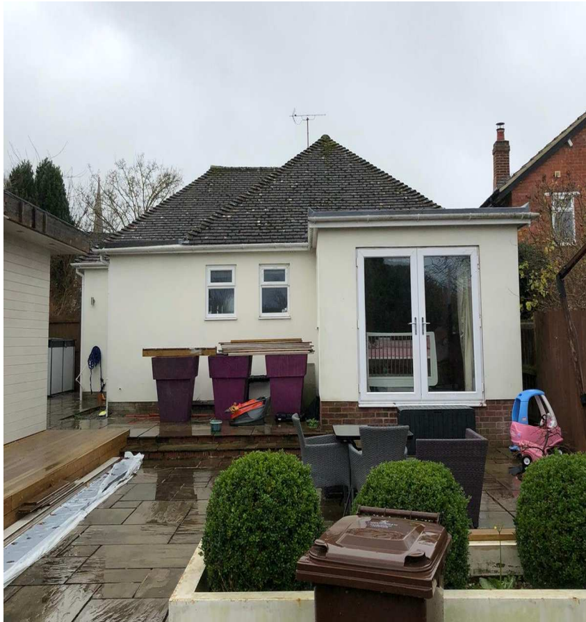
REAR ELEVATION OF THE DWELLING